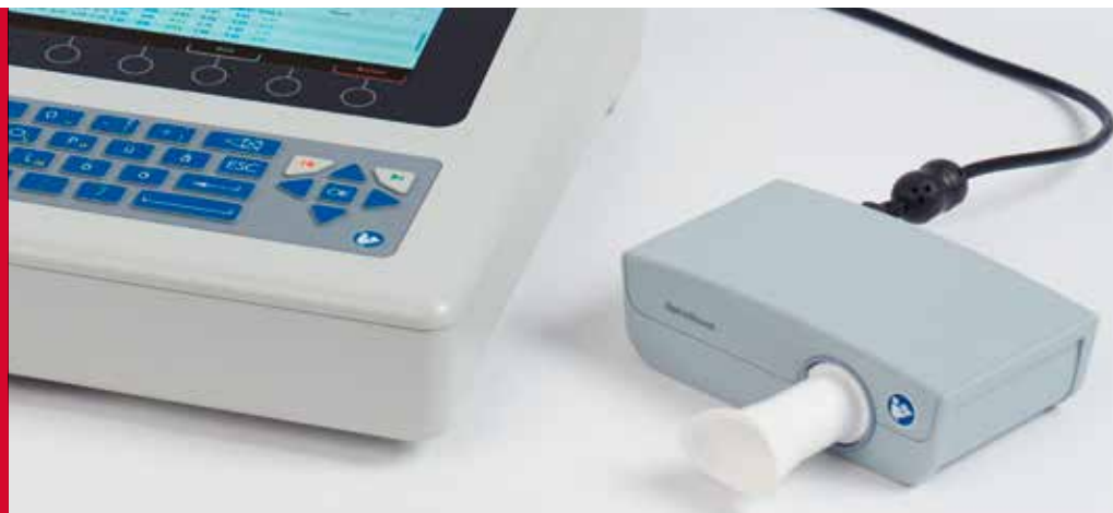
SpiroScout SP plus, for spirometry tests with the CARDIOVIT AT-102 G2