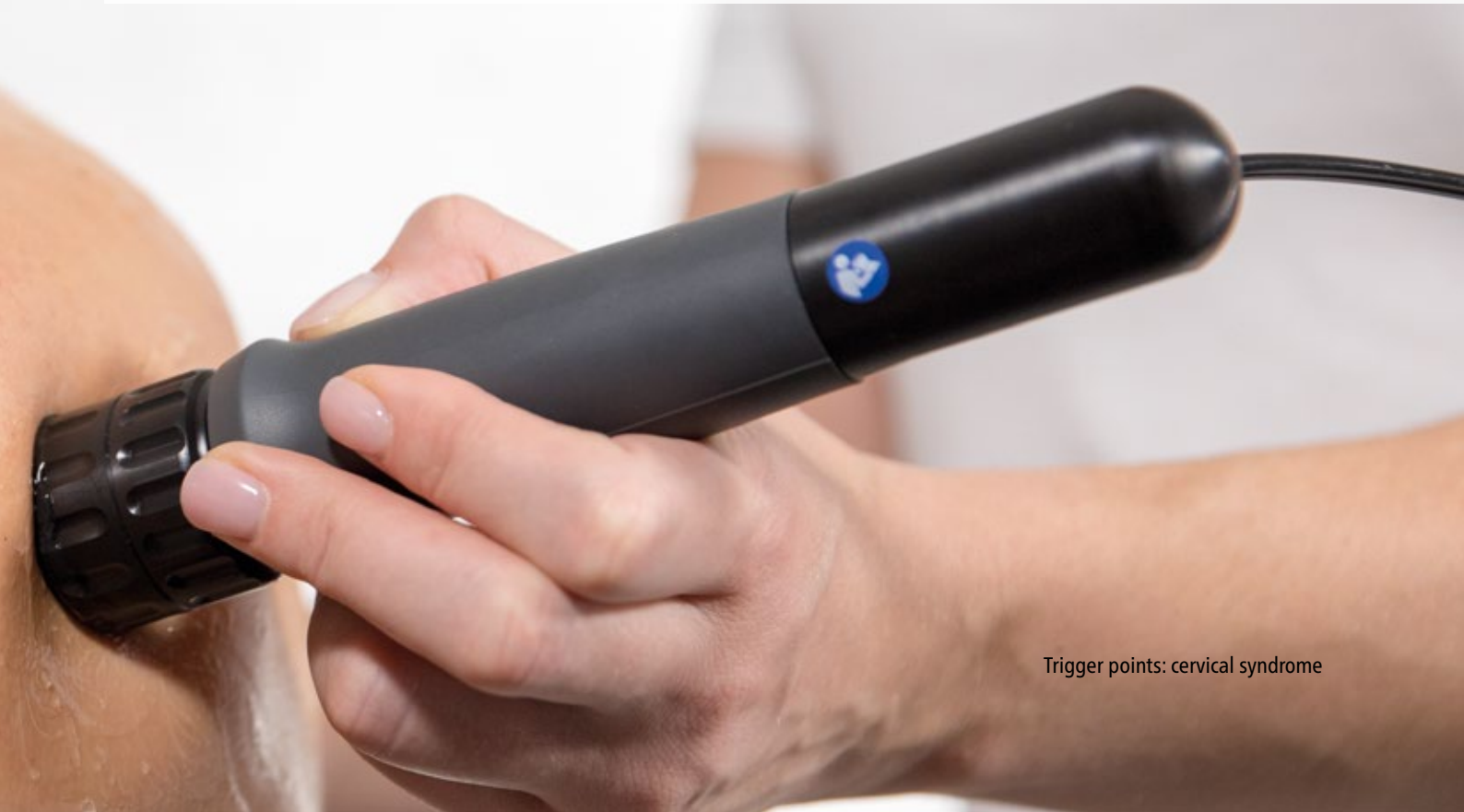
Trigger points: cervical syndrome