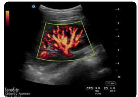
Kidney blood flow