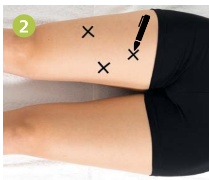
2 Mark the trigger points