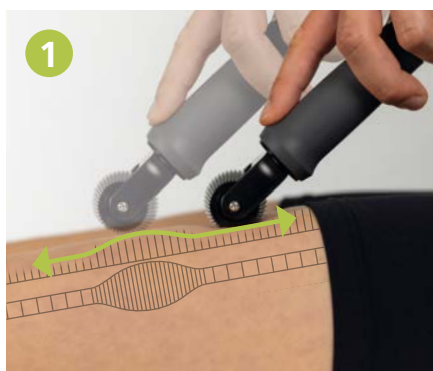
1 Identify the trigger points

Trigger points (TPs) and other disorders of the myofascial system are often what causes the pain and restricted functional movement associated with musculoskeletal diseases. Trigger points are primarily the result of muscle hardening and local swelling. The skin in the areas affected by them is also much more sensitive than the surrounding areas. To localise trigger points, the therapist rolls the TP-TOOL® over the areas of the body being examined. Hardened muscle will respond with slight resistance and tell the therapist more about the position, number and sensitivity of both deep and superficial trigger points. The TP-TOOL® is designed to support the therapist's hands and enable quick and easy investigations of the myofascial system, in turn allowing therapy (using radial and focused shock waves, for example) to be administered in exactly the areas that require it. »Localising trigger points with the TP-TOOL® is quick, precise and almost painless«, says Dr Stephan Swart.