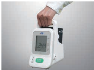
Easy to carry