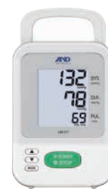
Measurement display (with backlight)