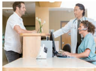
Stored and charged at nurse station