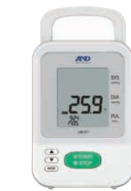
Stand-by display (Room temperature)