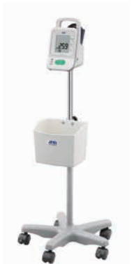
In combination with optional mobile stand