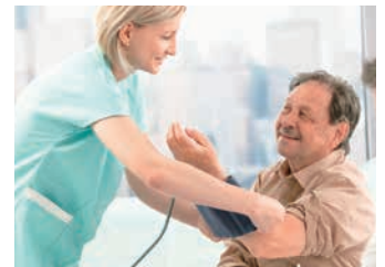
Measurement at ward