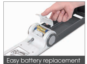
Easy battery replacement