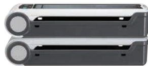
Flat base for stacking multiple units